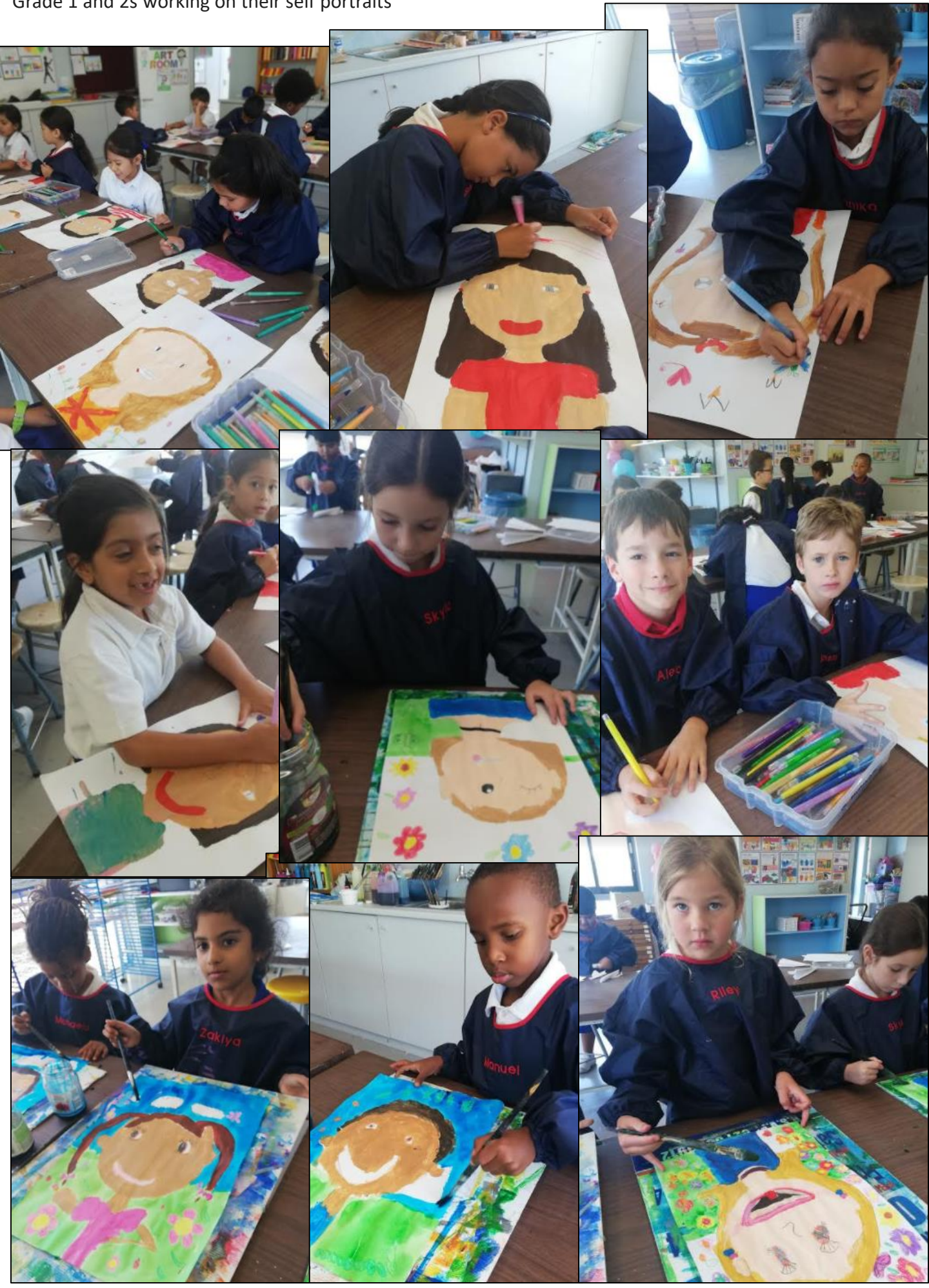
Grade 1 and 2s working on their self portraits